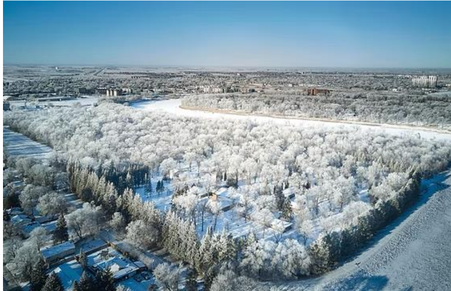
The Nature Smart Fund helped cities buy and protect natural areas like Winnipeg's LeMay Forest

The Nature Smart Fund, meanwhile, offered matched funds to cities to buy and restore natural urban lands, like intact forests and wetlands, that have managed to survive the urban onslaught of concrete and asphalt. Urban remnants of Nature that can form a bulwark against climate change, by mitigating heat island effect as well as reducing the risk of flash floods.