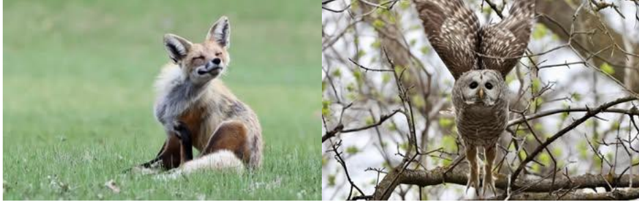
Just two of the animals that make the Lemay Forest their home.